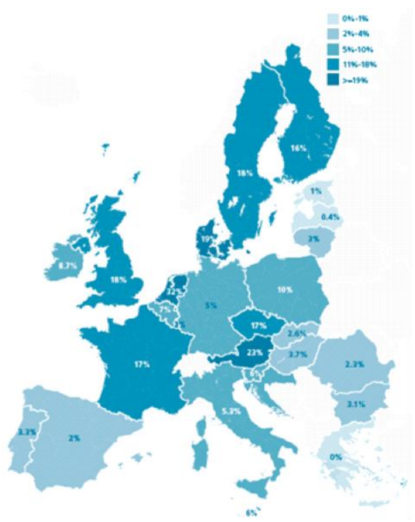
Figure 3: Social housing as a percentage of the total housing (Pittini en Laino, 2011: 23).

On the question of European colleagues how it can be that the Netherlands, as one of the richer EU countries, is in need of so much social housing, Netherlands still owes the answer. By defining an iron stock – the number of available homes for the primary target group – and the rest of the housing stock in a subsidiary, a commercial housing stock has appeared. By this model 'Servatius' – named after the Housing Corporation Servatius in Maastricht – (Aedes magazine 2007-4) by extrapolating to the Dutch social housing stock the Netherlands shares a similar place in the rankings as England, Austria, Denmark and the Czech Republic. This would be the solution for preventing the discussion in Europe about the social housing in the Netherlands and State aid, on which European Commissioner Kroes in 2005 from the European Union have previously complained.