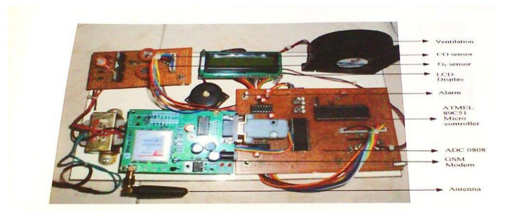
Figure 8: Prototype of the proposed system

The level of the toxic gas CO is continuously sensed by the sensor MQ-7. The level is displayed in the LCD continuously for each and every second. When the level of the toxic gas CO exceeds the normal level of 30ppm or the level of Oxygen decreases the normal level of 19.5%, then the microcontroller proceeds with an alarm. The GSM modem inside the vehicle sends a message to the authorized user about the alarming situation inside the cabin with the levels of the gases monitored by the sensors. Then ventilation is provided, so that the level of the toxic gases can be lowered as early as possible. This provides an immediate response to the situation which is an added advantage of the system. The prototype of the proposed system is shown in Figure 8.