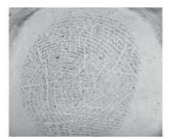
Fig - 3 (a) Fingerprint twin

Let I (n1, n2) embody a fingerprint doppelgänger of size N1 ×N2, where n1 \in [0, N1-1] and n2 \in [0, N2-1] denote horizontal and erect coordinates, respectively. Wanting loss of generality, each hint of I (n1, n2) is assumed to be quantized in 256 gray-scale levels, i.e., the forceful range of the twin is eight bits. However, the fingerprint twin may not use the full vibrant range in an everyday position and this may degrade system performance. The Unremitting Mean Quantization Transform (SMQT) is used as a forceful range adjustment in this tabloid .The SMQT can be viewed as a binary tree build of a simple Mean Quantization Units (MQU) where each level performs an automated disjointedness down of the evidence. Hence, with snowballing number of levels the more meticulous underlying information in the twin is revealed. This is equivalent to a nonlinear histogram stretch while still antibacterial rudimentary histogram silhouette. This nonlinear stuff of SMQT yields a well-adjusted twin intensifying.