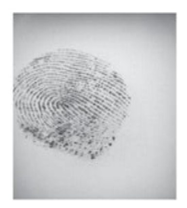
Fig - 1 Fingerprint Sensor Twin