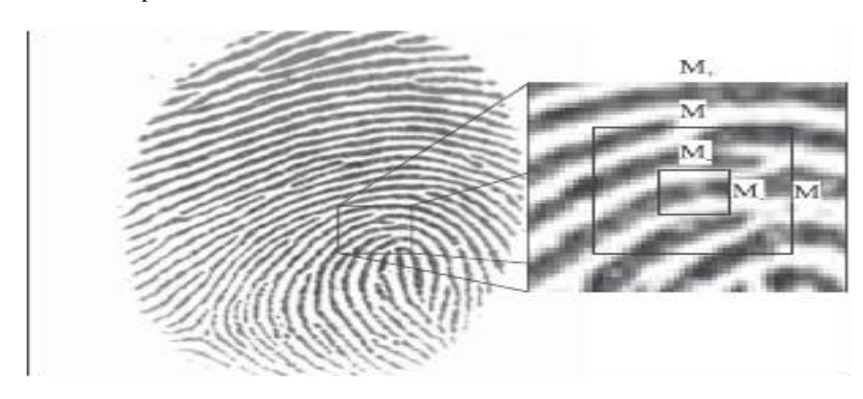
Fig – 5 Indigenous Adaptive Explorations

The persistence of the indigenous research is to adaptively approximation local phantom features analogous to fingerprint rim regularity and positioning. Most parts of a fingerprint twin containing ridges and valleys have, on a local scale, similarities to a sinusoidal signal in noise. Hence, they have a magnitude spectrum with two distinct spectral peaks located at the signal's dominant spatial frequency, and oriented in alliance with the spatial signal, see the example in Fig. 2. In addition, the magnitude of the dominant spectral peak in relation to surrounding ghostlike summits designates the ability of the dominant gesture. These geographies are consumed in the local exploration.