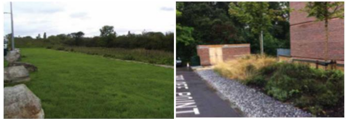
Figure 10. Solution using bio-storage system