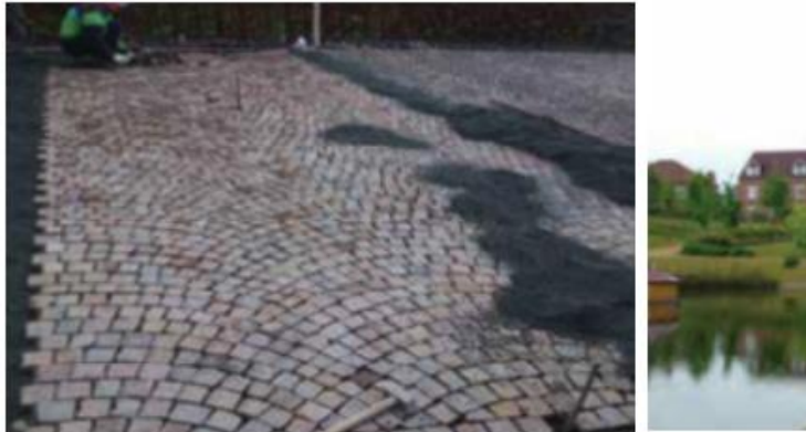
Figure 12. Solutions to using lakes and wetlands

Figure 11. Solutions to use permeable pavement