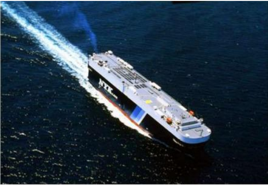
Cargo ship directed by solar panels