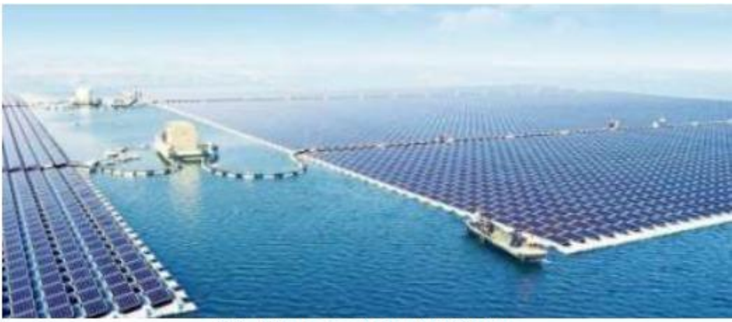
World's largest plant in China