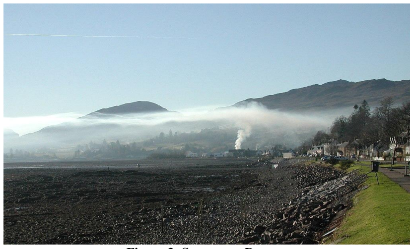
Figure 3: Smog over Donora

A typical photo of Donora with dangerous smog is shown in figure 3.