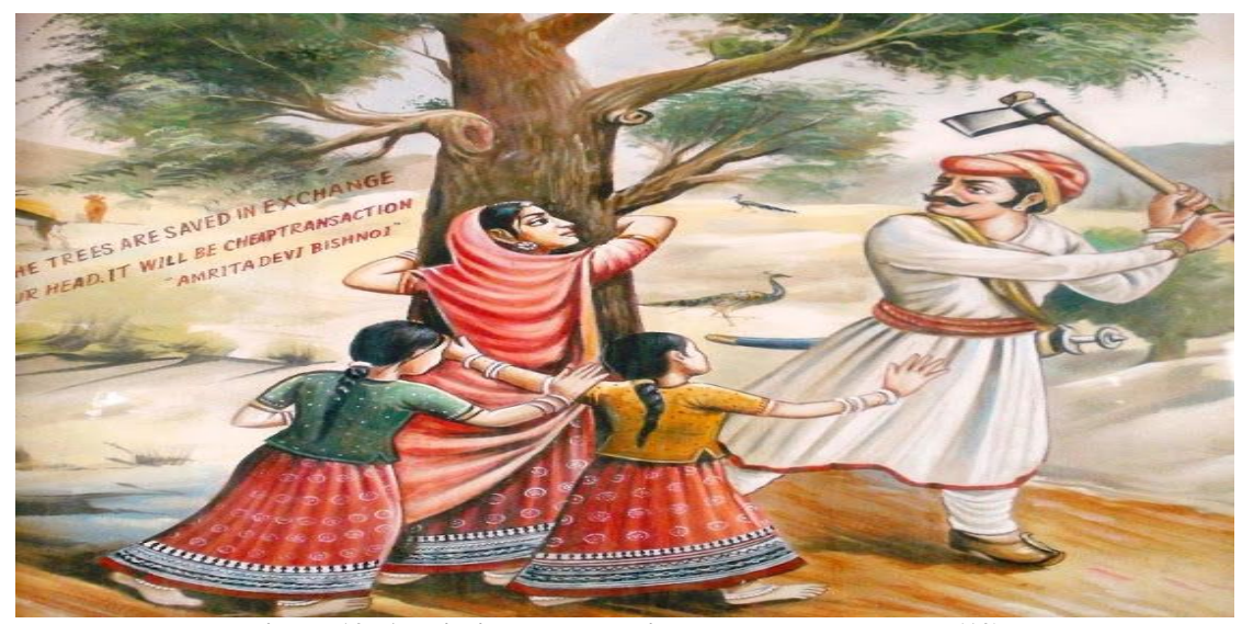
Figure 10: A painting that describes about the Massacre (10)

When the king heard about what his one order caused then he came by himself to apologize and vowed that in his reign no one would cut trees or animals. Chipko movement in 1970's was also inspired by this Khejri Massacre.