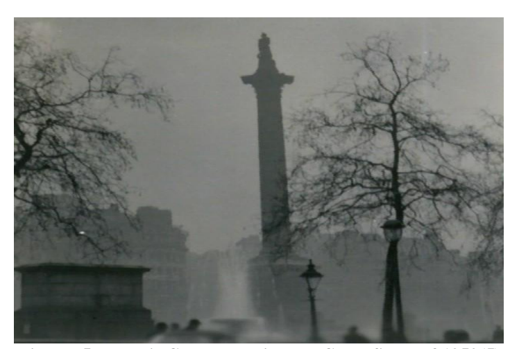
Figure: 5 Nelson's Column during the Great Smog of 1952(5)

December 5<sup>th</sup> to 9<sup>th</sup>, a severe air pollution episode took place in London. High concentrated air pollutants formed a thick layer of smog with the cold weather and calm wind condition. Like the other smoke incidents in history, this thick layer of smog which caused disruption in visibility and respiration, was also a caused by air pollutants from burning of coal. By December 8<sup>th</sup> 4,000 people died due to smog. 100,000 people reported illness related with respiratory system. Even after these 4 days the fatalities was continuously rising and it rose up to 6000 in the following month. Although this incident was worst air pollution event in history of U.K. yet suffering from air pollution isn't any new for London, since 13<sup>th</sup> century it is suffered from its poor air quality which was highest in 16<sup>th</sup> century. But later London worked on its policy towards environment in 19<sup>th</sup> century (5).