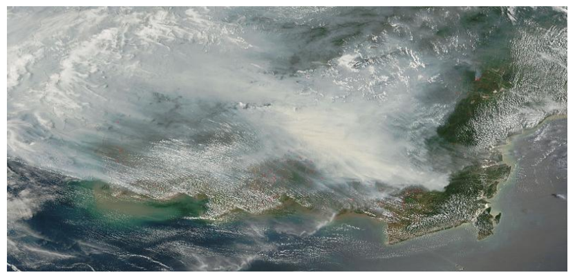
Figure: 8 Satellite photograph of the haze above Borneo(8)

Burning of Slash is common among farmers as it is quite cheaper than any other alternative. In Indonesia, a haze that affected many countries like Malaysia, Singapore, Thailand and even South Korea, which was a result of continuous burning of slash and cultivation, in 2006. This caused toxic pollutants in the air and poor health of people living in urban areas(7).