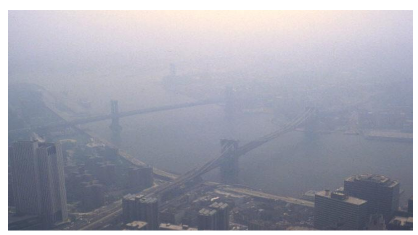
Figure: 4 Smog in New York City as viewed from the World Trade Center in 1988(4)