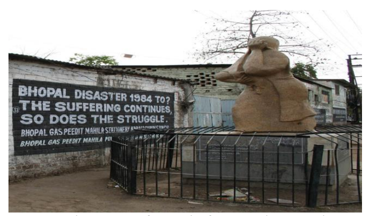
Figure: 9 Memorial by Dutch artist Ruth Kupferschmidt for those killed and disabled by the 1984 toxic gas release

It wasn't just the worst tragedy of India but all over the world. Near about 500,000 people were exposed to the highly toxic gas. This gas caused 3,787 deaths and 558125 injuries. But soon it was estimated that 8000 or were died within two weeks. It was a result of inadequate maintenance of stack, pipes which resulted in backflow of water into the Methyl Isocyanate Tank(9).