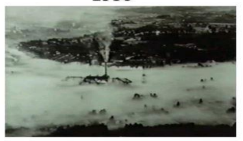
Air inversion results in 60 dead and thousands sick from exposure to industrial air emissions.