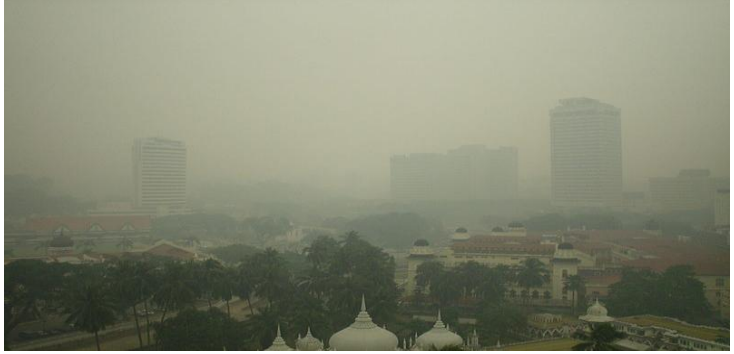
Figure 7 Smoke engulfing the country capital, Kuala Lumpur(7).

Figure 1.7 shows smoke over Kuala Lumpur(7).