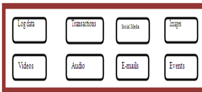
Fig.2.1 Sources of Big data