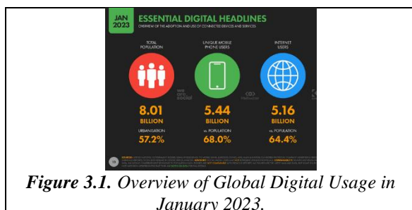
Figure 3.1. Overview of Global Digital Usage in January 2023.

Statistics from Hootsuite and We Are Social indicate that as of January 2023, there were 5.44 billion mobile phone users worldwide (accounting for 68% of the global population) and a staggering 5.16 billion internet users (representing 64.4% of the global population) [3].