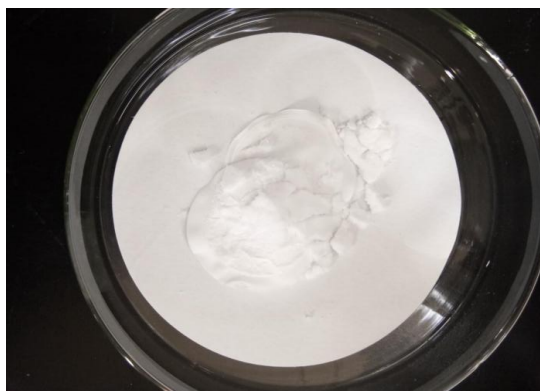
Fig. 2 Appearance of heparin sodium by trypsin mutant process

As shown in Fig. 2, the heparin sodium product by trypsin mutant process is white powder. The yield and potency of crude heparin sodium by recombinant trypsin mutant is 11.74% (using 50g intestinal mucosa) and 97.59 U/mg, more than the standard trypsin and recombinant trypsin wild-type. So recombinant trypsin mutant could be used in the production of heparin sodium to improve product yield and quality.